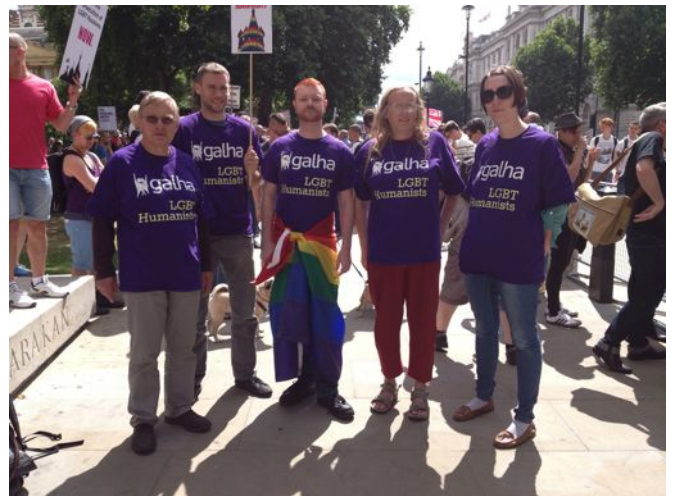
Galha members sending love and solidarity to our LGBT brothers and sisters in Russia